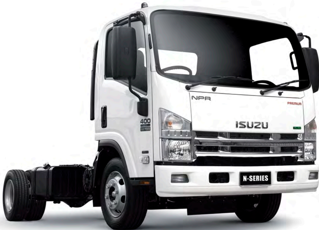
NPR 400 Premium

AUSTRALIA'S TOP SELLING TRUCK BRAND SINCE 1989.