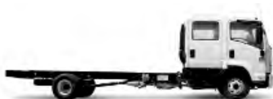
FRR 600 Crew