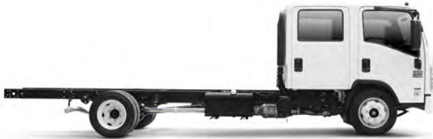
NQR 450 Crew