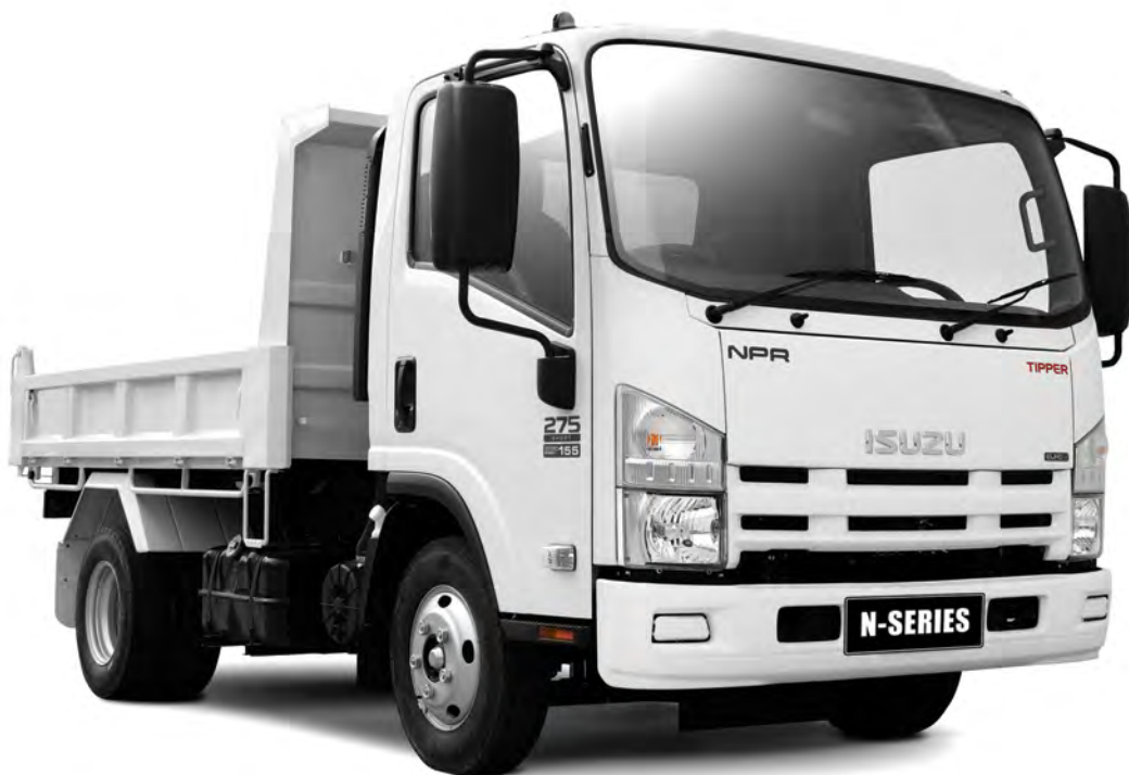
NPR 275 pictured

AUSTRALIA'S TOP SELLING TRUCK BRAND SINCE 1989. Truck tracker 2009.