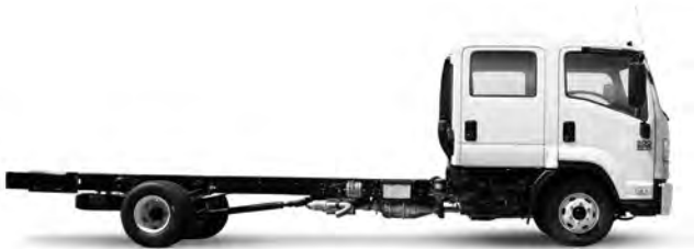
FRR 500 Crew