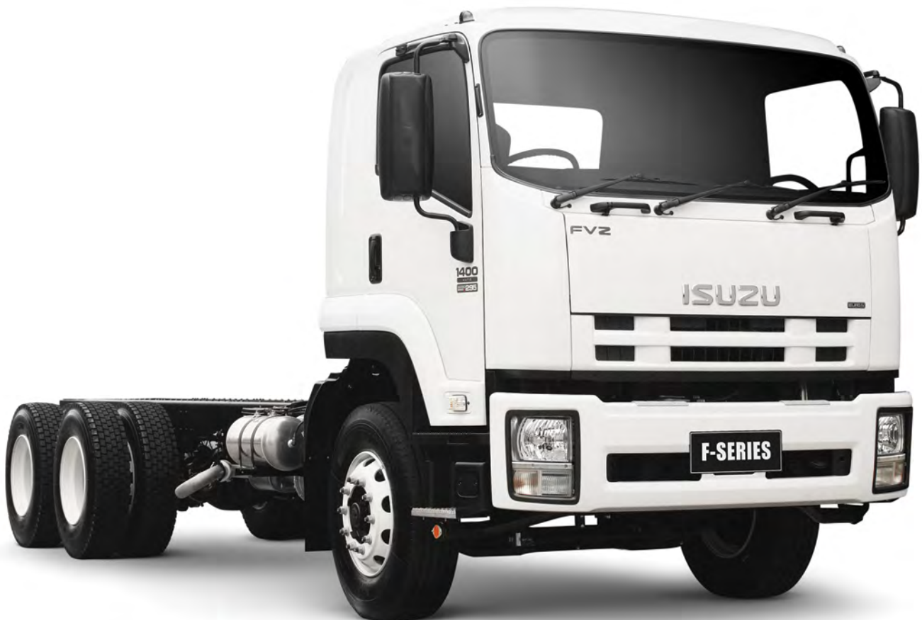
FVZ 1400 pictured

AUSTRALIA'S TOP SELLING TRUCK BRAND SINCE 1989. Truck tracker 2009.